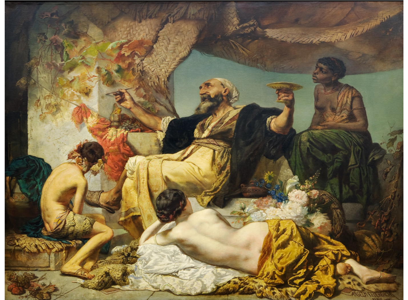
Reference painting : Hafis vor der Schenke 1852 Anselm Feuerbach